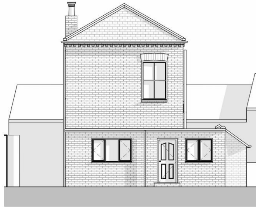
West Elevation 1 : 100