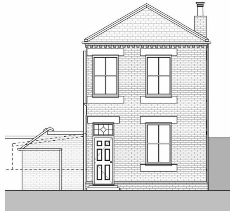
East Elevation 1 : 100