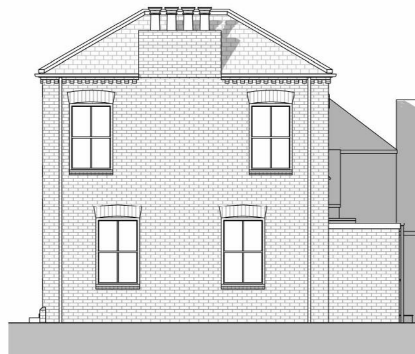
North Elevation 1 : 100